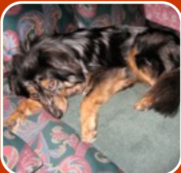
Wait till he sees this!